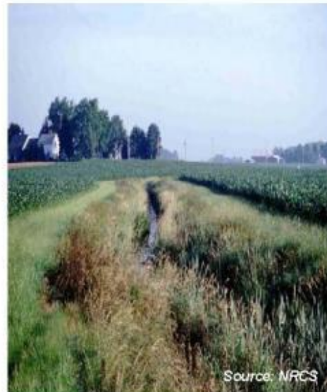
Grass filter strips