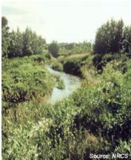
Riparian buffer strips