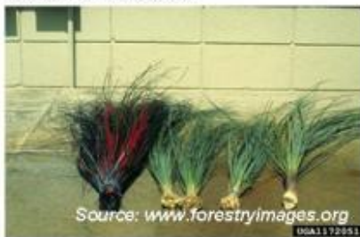
Common Bear Grass